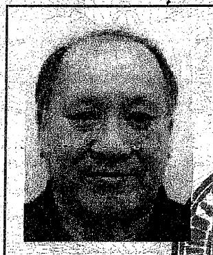
Photograph of Bearer

National status MALAYSIA Place of birth SARAWAK Date of birth 27 MAY 1954 Height 168 CM Colour of hair BLACK Colour of eyes BLACK Visible peculiarities NIL